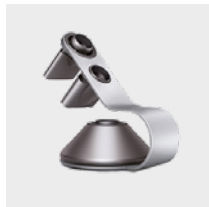
Display stand (available for purchase)