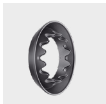
Gentle air attachment